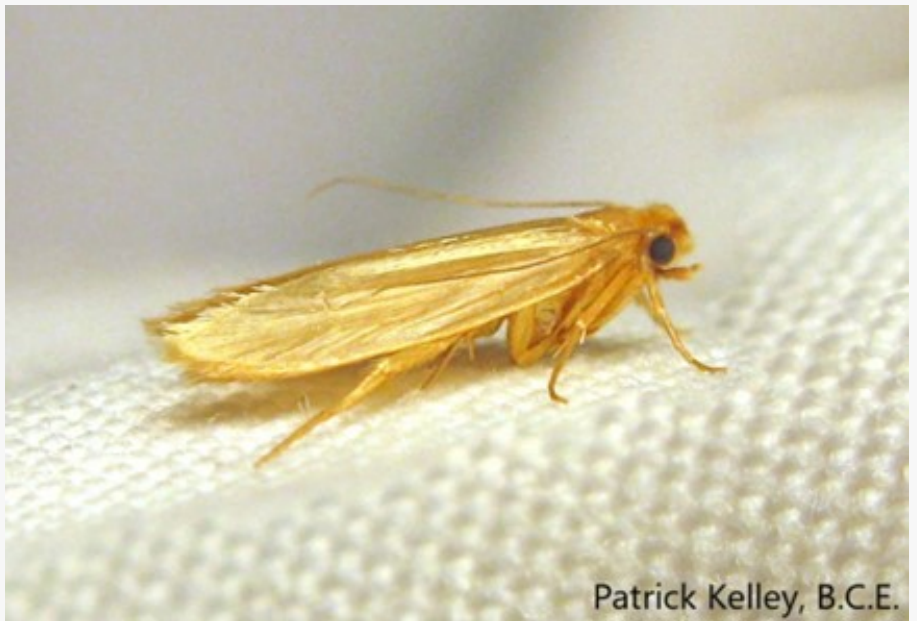
Patrick Kelley, B.C.E.

Today, clothes moths are found infesting items in households, museums, grain storage facilities, pet food warehousing, and other structures that work with wools, furs, and feathers.