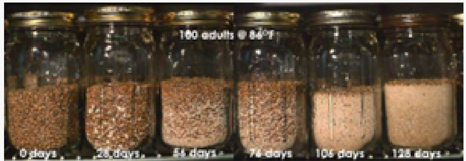
Figure 1. Insect damage to wheat over 128 days.

Stored product insects account for significant losses in post-harvest stages. They feed on, breed in, and contaminate stored food, resulting in significant quality and quantity losses. From grain to dried fruits, no stored food product is truly safe from their insidious damage. Therefore, understanding and managing these pests effectively is key to safeguarding our food supplies and feeding a hungry world.