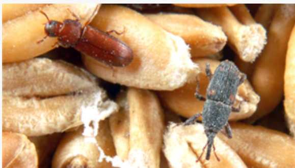
Figure 2. Red flour beetle and rice weevil on kernels of wheat.