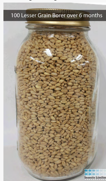
Figure 4. Lesser grain borer damage to wheat over 6 months.

The 'Start with the pest first' approach forms the backbone of effective IPM for stored product insects. It reminds us that each pest management journey begins with understanding the pest. Let's continue to build our knowledge and skills in IPM, and contribute to the global effort to feed our growing world.