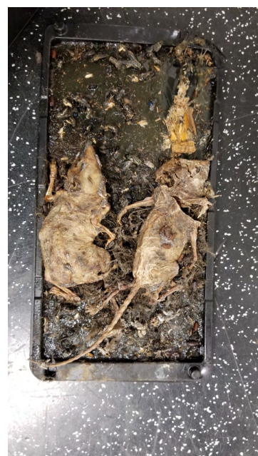
Clothes moths and dermestid beetle larvae have consumed the hide and hair from the rodent on the left. The image on the right also shows evidence of clothes moth and dermestid larval feeding alongside blow flies and sarcophagid flies and puparia. You can see these two mice on this glue board are earlier in their decomposition since there is more flesh and skin evident.

**A very special thanks to Louis Sorkin, BCE for the ideas behind this article and the detailed images of clothing moths on dead and desiccated rodents.