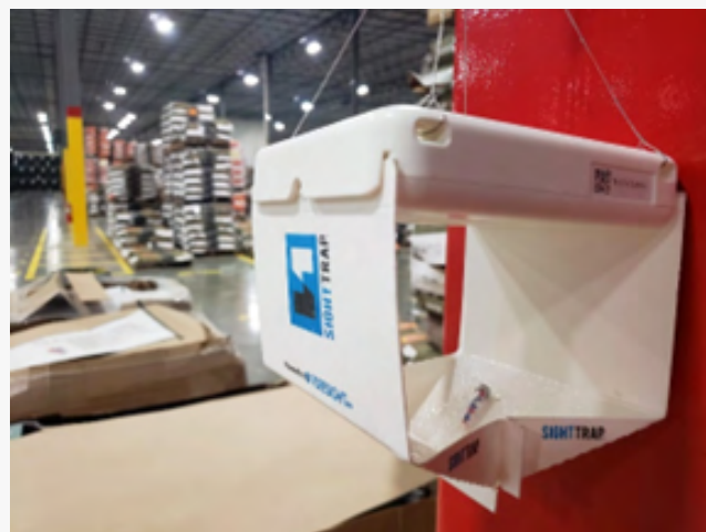
Figure 3. Remote pheromone monitoring device called the SightTrap from Insects Limited.

Continual monitoring and evaluation of pest populations and treatment effectiveness are essential components of IPM. Regular monitoring allows for early pest detection and intervention, preventing large-scale infestations. Evaluating the success of treatments ensures resources are not wasted on ineffective methods, while providing valuable data for future pest management.