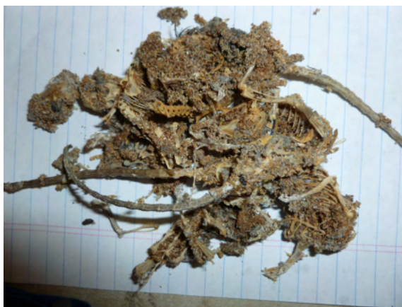
A completely consumed rodent carcass covered in webbing clothes moth frass and some empty pupae.