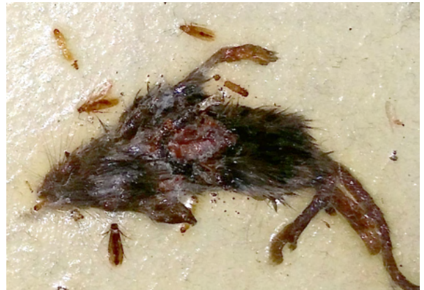
Moths and caterpillars around a dead mouse on a glue board.