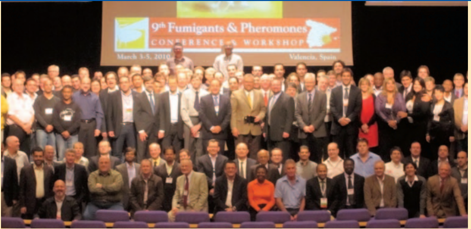
9th Fumigants & Pheromones Technical Conference, Valencia, Spain. (44 countries)