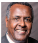
Dr. Gebisa Ejeta Purdue University, USA/Ethiopia Food Security Around the World