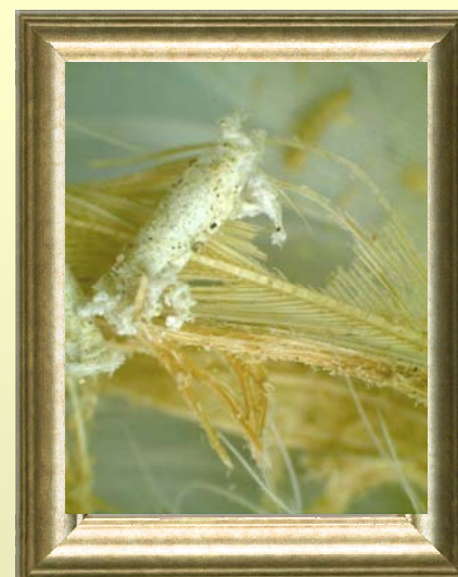
Casemaking clothes moth pupal case and damage on feather