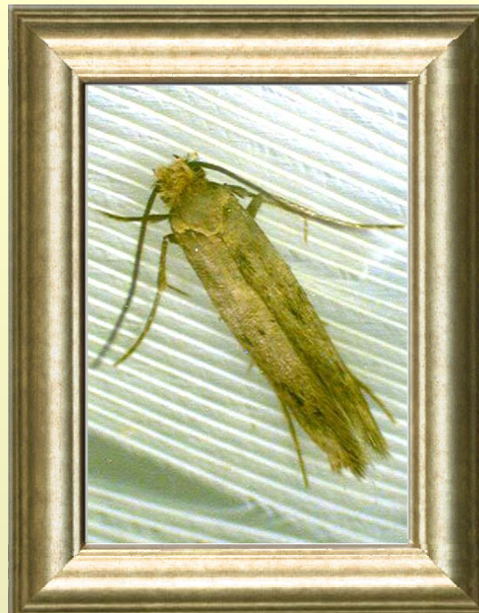
Casemaking clothes moth adult

Tinea pellionella is worldwide in distribution. Its common name of casemaking clothes moth comes from the fact that the larvae will carry a silken case with it throughout the entire larval stage until it finally uses the same case to pupate in. The case consists of silken material produced by the larva intertwined with fibers from the material it is feeding on. As the larva grows, it will enlarge the case by making a slit on both sides of the case and inserting triangular sections of new material. In this same fashion it will increase the length of the case by adding new material to either end. If the case is removed from the larva when it is near pupation it will die. The larva will drag the case with it as it feeds. It will thrust out its head and thoracic legs and pull the case along with it. Immediately prior to pupation, the larva will often seek a protected site such as a crevice, wall or often the ceiling of the room of the infestation.