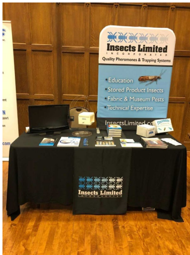
Insects Limited's vendor booth

technology allowing for remote monitoring of different target pests, rodents and insects alike.