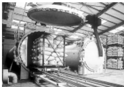
Two hour treatment with \text{CO}_2 and pressure.

Carbon dioxide levels of 3-5% force the insects' sensors to record high levels of \text{CO}_2 and the spiracles are told to stay open. In a normal situation the spiracles would only be open for less than a second and then they would close.