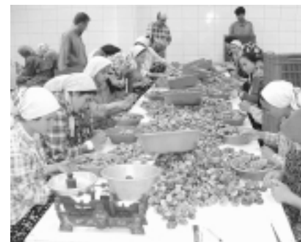
Sorting dried figs in Turkey. A phase-out of 50 tonnes of methyl bromide is proposed by 2003.

phosphide or phosphine (PH 3 ). Phosphine is a proven technology in storage, including commodities, structures, containers, chambers, vehicles, and stacks under tarpaulin.