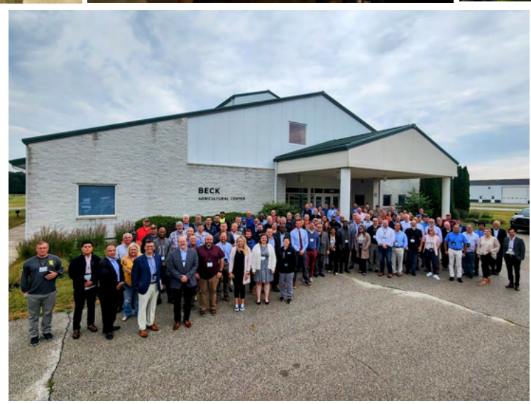
View the full photo album from the 14th Stored Product Protection Conference <a href="here">here</a>.