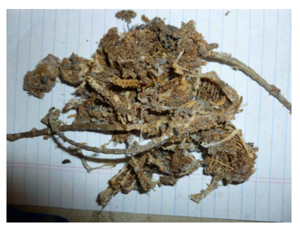
A completely consumed rodent carcass covered in webbing clothes moth frass and some empty pupae.