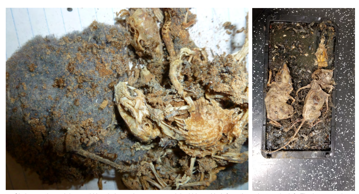
Clothes moths and dermestid beetle larvae have consumed the hide and hair from the rodent on the left. The image on the right also shows evidence of clothes moth and dermestid larval feeding alongside blow flies and sarcophagid flies and puparia. You can see these two mice on this glue board are earlier in their decomposition since there is more flesh and skin evident.

**A very special thanks to Louis Sorkin, BCE for the ideas behind this article and the detailed images of clothing moths on dead and desiccated rodents.