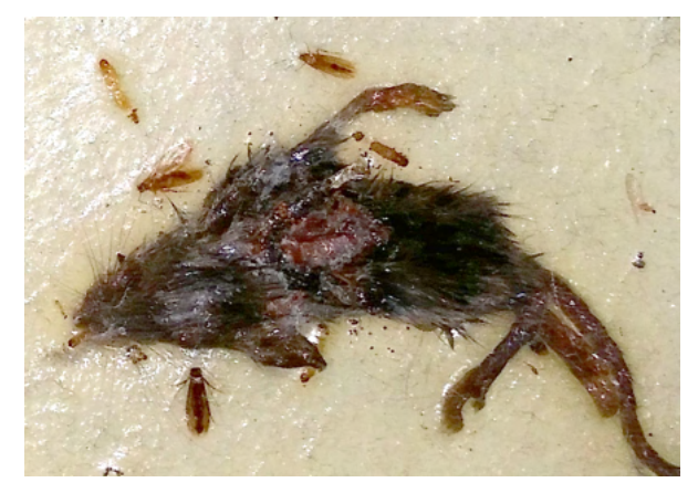
Moths and caterpillars around a dead mouse on a glue board.