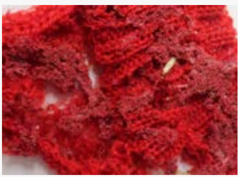
<u>Webbing clothes moth</u> damage on wool will present itself as silken tubes as seen in the photo (left) or as frass-covered feeding tubes as seen on the photo (right). Occasionally, you might also find cream colored larvae and live and dead adult moths.