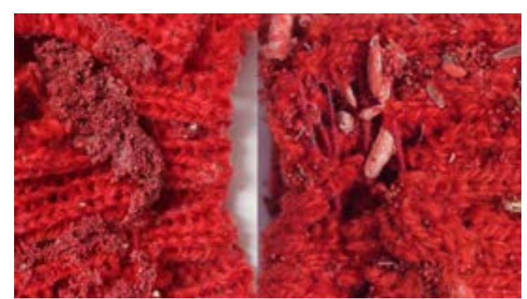
Webbing Clothes Moth Frass Casemaking Clothes Moth Frass In the photo above, the clumpy, frass-covered feeding tubes and pupal cases on the left indicate webbing clothes moth, Tineola bisselliella damage, and the cylindrical pupal cases and loose frass on the right indicate casemaking clothes moth, TTinea pellionella damage.