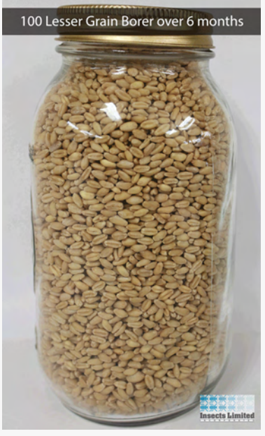
Figure 4. Lesser grain borer damage to wheat over 6 months.

The 'Start with the pest first' approach forms the backbone of effective IPM for stored product insects. It reminds us that each pest management journey begins with understanding the pest. Let's continue to build our knowledge and skills in IPM, and contribute to the global effort to feed our growing world.