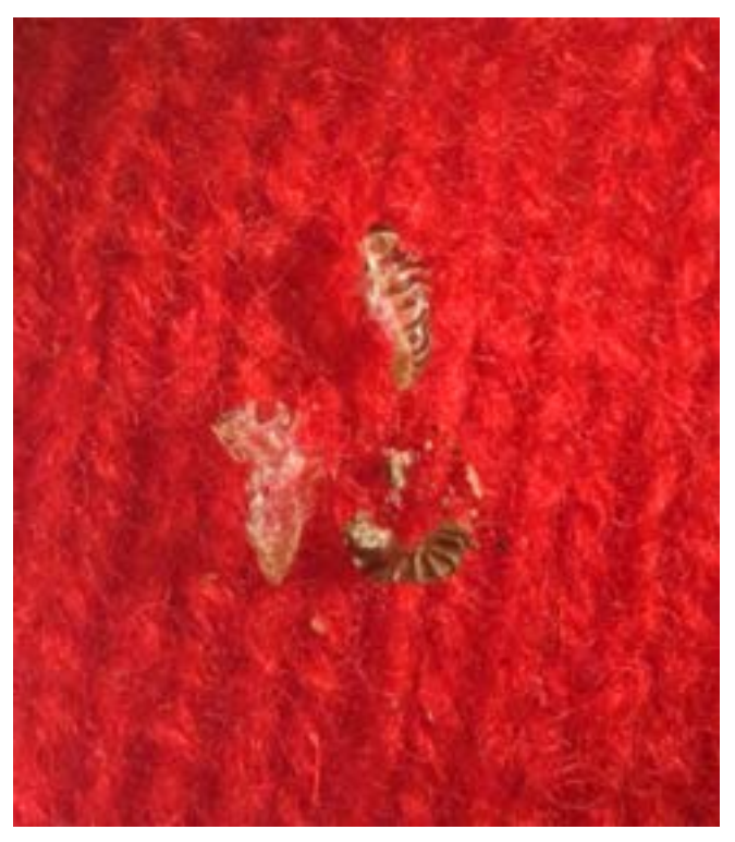
Signs of dermestid beetle activity on wool will often present itself with the presence of larval shed skins. Some dermestid beetles will shed their skins up to 20 times as a larva and these skins and associated frass will alert you that carpet beetles are the ones causing the damage.

In any identification of frass that we might undertake, we need to be good detectives and look at every clue that we can see. With a bit of knowledge and a good eye, we can figure out who our enemy might be that is feeding on the wool.