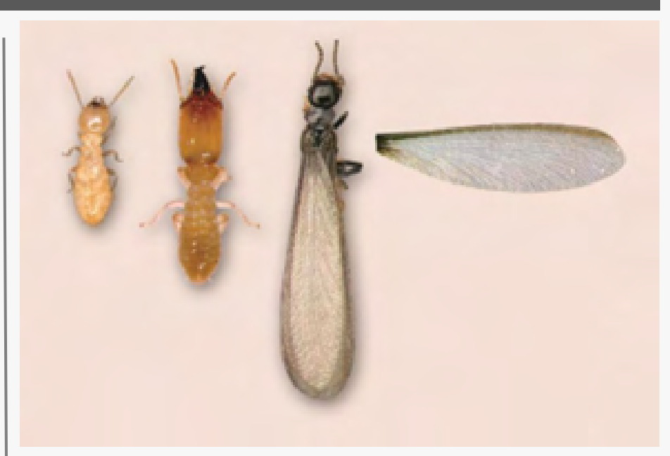
Figure 1. Castes of termites: worker, soldier, winged reproductive, and wing detail.

While seemingly distinct, termites and cockroaches are in fact closely related members of the superorder Dictyoptera, characterized by unique traits including the capacity to encase eggs within an ootheca (in some species), gradual metamorphosis (paurometabolous), and a perforation in the tentorium or internal skeletal structure of the head.