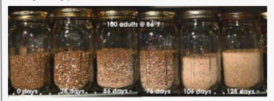
Figure 1. Insect damage to wheat over 128 days.

Stored product insects account for significant losses in postharvest stages. They feed on, breed in, and contaminate stored food, resulting in significant quality and quantity losses. From grain to dried fruits, no stored food product is truly safe from their insidious damage. Therefore, understanding and managing these pests effectively is key to safeguarding our food supplies and feeding a hungry world.