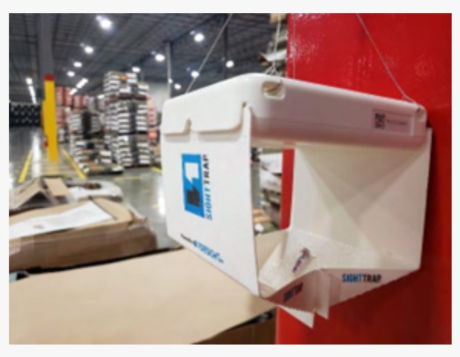
Figure 3. Remote pheromone monitoring device called the SightTrap from Insects Limited.

Continual monitoring and evaluation of pest populations and treatment effectiveness are essential components of IPM. Regular monitoring allows for early pest detection and intervention, preventing large-scale infestations. Evaluating the success of treatments ensures resources are not wasted on ineffective methods, while providing valuable data for future pest management.