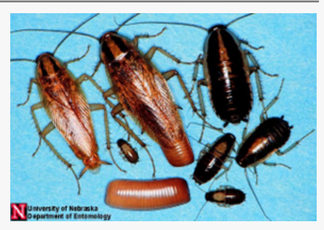
Figure 3. German cockroach life stages.

Both harbor symbiotic relationships with various protozoans and bacteria that break down cellulose and produce methane. As a result, termites and cockroaches together account for nearly 20% of global methane emissions, making their ecological role more significant than it may seem at first glance.