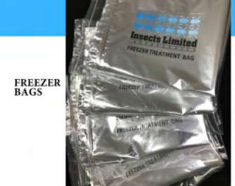
Clothes moth larvae and eggs can be killed with a long exposure to freezing temperatures. Items that you wish to freeze can be placed in our Freezer Teatment Beer