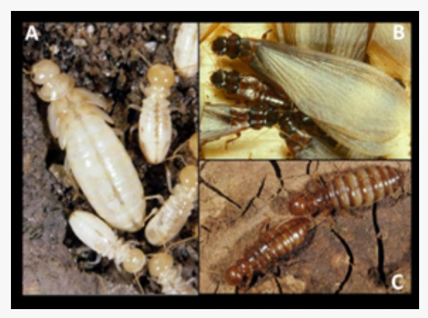
Figure 2. Basal termite species, Mastotermes darwiniensis including a) juvenile nymph with workers b) winged reproductives c) wingless reproductives.

Even their construction methods bear striking resemblance. Some cockroaches use debris mixed with saliva to conceal their oothecae, while subterranean termites utilize this material for nest building and foraging tubes. Certain species, such as the brown-hooded cockroach and the Mastotermes darwiniensis termite, even display similar social behaviors and reproductive structures.