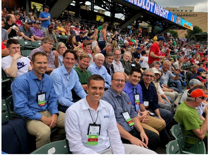
The 2018 Fumigants & Pheromones speakers enjoying an evening out together at the Indianapolis Indians baseball game.