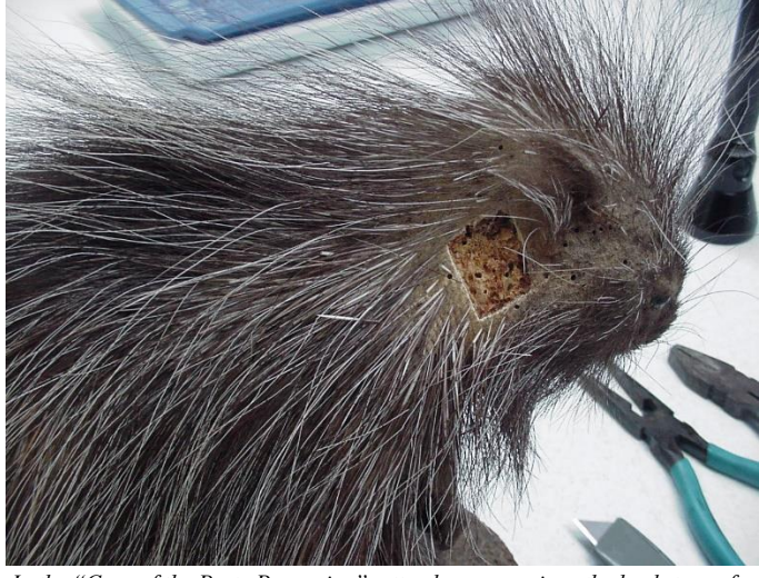
In the "Case of the Pesty Porcupine", attendees were given the backstory of a situation involving a mysterious infestation of drugstore beetles

they had learned from the workshop and their own experience, the teams saved the day by piecing together the story of a lone, drugstore beetle infested, porcupine before the problem spread to the rest of the collection.