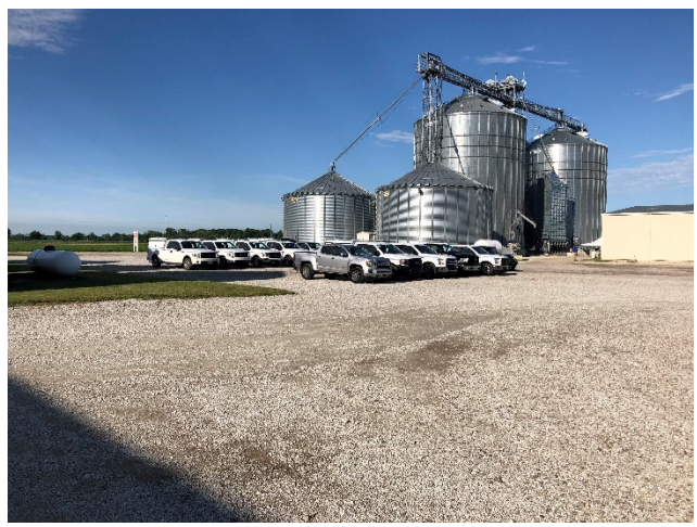
Grain storage facilities at the site of the Fumigation Workshop

What started as discussions and presentations ended with an excellent opportunity to take those "classroom lessons" and apply that knowledge in real world scenarios.