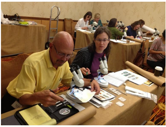
Students identify museum pest insects under a microscope during a 2013 AIC IPM workshop

included principals of museum IPM, how to identify common (and some not so common) museum pests, best practices in prevention, and the ever-popular "Cases of the What Dun It."