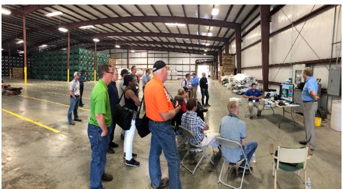
Attendees closely watch a presentation on remote rodent monitoring at the 13<sup>th</sup> Fumigants & Pheromones Conference workshop

army where I oversaw instructing emergency medicine to my company...so you could say that I get a sense of elation when I get to witness those "light bulb" moments. Those moments are why we, FSS, Inc. and Insects Limited, focus on the fine details of the conference, because we believe in the power of knowledge and education!