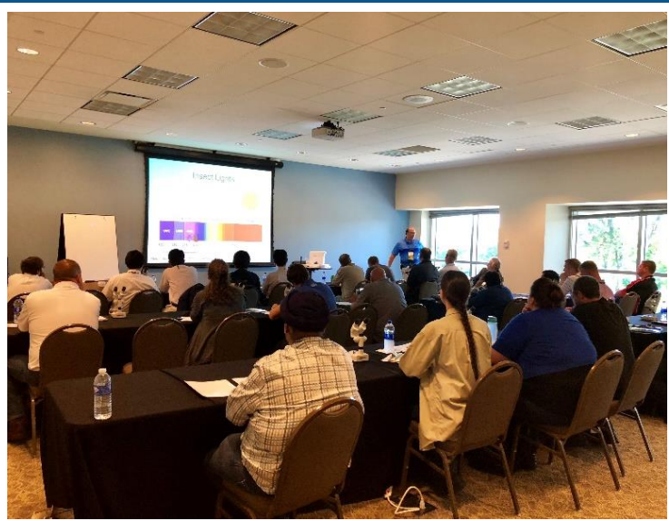
Pat Kelley of Insects Limited (USA) teaching the Museum Workshop attendees about Museum Pest Management.