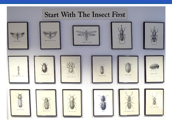
The "Start with the Insect" Wall in the classroom at Insects Limited and Fumigation Service & Supply

Stepping back and looking at the big picture of pest management, it should now be a bit clearer on why it is so important to begin with a correct identification of your pest. Starting off in the correct direction can quickly give you the results of less pest activity. In the long run, both money and time will be saved by taking the time to correctly identify the pest. I hope you can now join us at Insects Limited and Fumigation Service & Supply in our rally cry: " Start with the Insect! ".