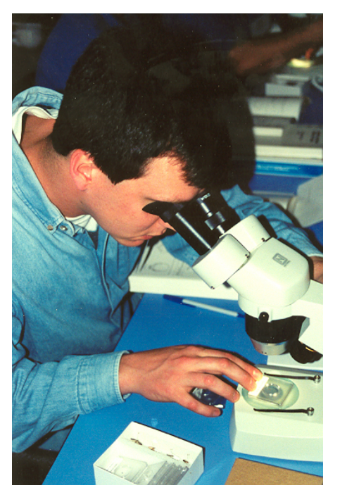
A typical Insect Identification class held at Insects Limited offices.

Once you can see who your potential enemy is, it is vital to know different types of identifying features in their physical shape and size. Other identifying features include; shape and length of antennae, coloration, presence of wings, vein pattern in wings, hair pattern, scale shape and many others. It's much like being a detective. There are educational classes in insect identification available through Insects Limited, books references (Mallis Handbook, PCT Field Guides, Peterson Field Guides, etc.), online resources (Bugguide.net, MuseumPests.net, etc.) as well as direct contact with entomologists through professional companies or universities that can assist with identification. Double checking your identification through multiple sources can prove beneficial toward obtaining a correct conclusion.