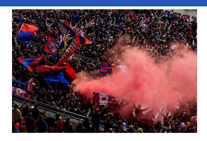
Imagine you are trying to locate your friend at a stadium. Your friend lights a flare to indicate their location. You follow the smoke trail until you find them.

To attract males to her for mating, a female Indian meal moth will produce and release pheromones from her abdomen. The pheromone release creates a plume that is carried in the wind. The plume allows male moths to use their antennae to follow the pheromone back to the source and to physically locate females. Mating disruption dispensers release large amounts of pheromone into an area, masking the natural pheromone coming from the female moths. This flood of pheromone makes it difficult for males to locate females. The stadium illustrations below help illustrate how this concept works. Since males cannot find females to mate with, fertile egg laying is reduced resulting in subsequent lower populations. By reducing the population of Indian meal moths, mating disruption can help protect your commodity, products and reduce customer complaints of insect infested product.