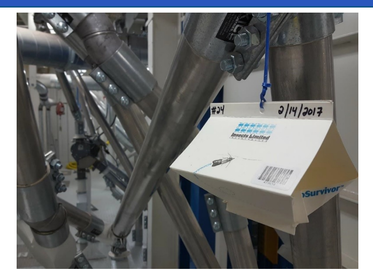
NoSurvivor hanging trap with bullet lure used to monitor Indian meal moth activity at the seed warehouse (Indian meal moth Kit).

Mating disruption is labeled for use on stored grains, processed grains (flour in mills and bakeries), pet food, nuts, tobacco, dried fruit, chocolate and other confectionary products. It targets the Indian meal moth ( Plodia interpunctella ), Mediterranean flour moth ( Anagasta (Ephestia) kuhniella ), Almond moth ( Ephestia cautella ), and Tobacco moth ( Ephestia elutella ). Dispensers should be attached in grid patterns according to the labeled rate. While pheromones used in monitoring traps are exempt from EPA registration, those same pheromones used as mating disruption are a labeled pesticide. Dispensers will typically emit effective amounts of pheromone for approximately 90 days.