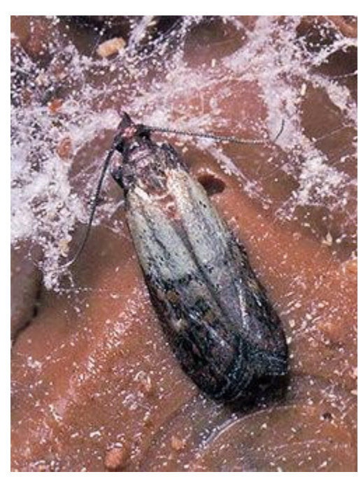
Adult Indian meal moth (Plodia interpunctella)