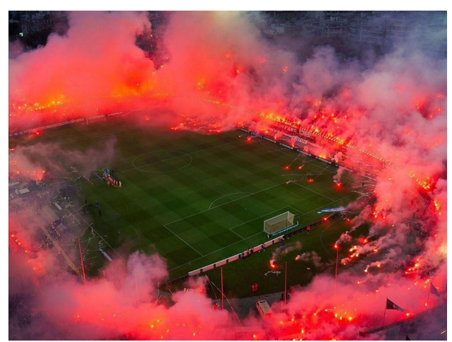
Now imagine flares and smoke trails everywhere at a stadium. There is no way for you to find your friend. Mating disruption works similarly by masking the natural pheromone trail making it difficult for males to locate females.

Indian meal moth populations typically fluctuate with temperature and humidity. In Indiana, USA, we typically see Indian meal moth populations begin to increase around late March. Below is a graph of Indian meal moth pheromone trap captures in a 300,000 ft<sup>2</sup> seed warehouse