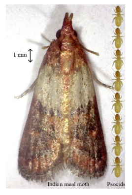
Comparing the average length of an Indian meal moth adult to that of booklice, you could line up 8 booklice to equal the length of a single Indian meal moth.

Beginning with the meaning of the phrase, it is really telling ourselves that any pest treatment begins with proper identification of the pest. This first step in pest management can be a difficult one depending on your experience or entomological background. Most of the stored product insects that we deal with are relatively small. On the larger end of the scale are Indian meal moths, Plodia interpunctella measuring at 3/8 inch to \frac{1}{2} inch (10 - 13 mm) in length. On the smaller end of the spectrum are the psocids (Otherwise called "book lice") that measure in at less than 1/16 inch (1 - 1.5 mm) in length. You could literally line up 8 or more psocids is a straight line to equal the length of one Indian meal moth adult. In order to correctly identify creatures this small, it is often necessary to have magnification in the form of a magnifying glass or even a microscope.