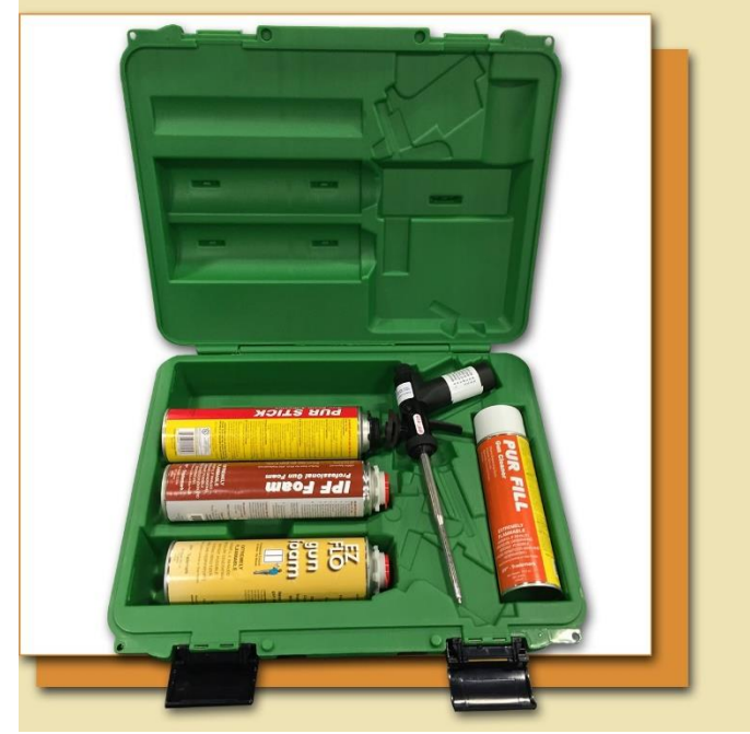
Professional foam gun kit with sealant.

<u>Window or Construction Gaps</u> Window frames on the exterior of a building can often have gaps between the siding and the window frame that allow pest entry on either side, above or below the frame. Over time, gaps can also develop in construction materials that allow pest entry. A professional foam material (e.g. Foam applied through a Pageris Foam Gun) should be applied in these and any gaps around the exterior of the building. Avoid using some of the commercial foams that expand after being applied as they are hard to work with and become quite messy. They often get on the building materials themselves and cleanup is nearly impossible.