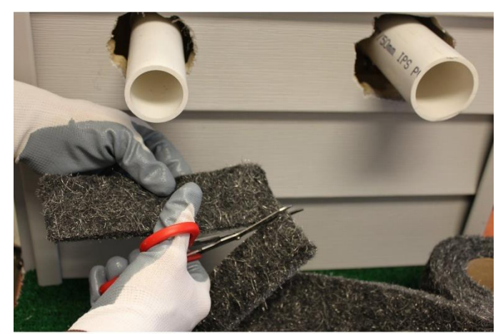
Xcluder brand Fill Fabric getting prepped to fill around a pipe chase.

Gaps around a pipe chase: The point of entry where a plumbing, HVAC or electrical pipe conduit passes through an outside wall and into a structure can be called a "pipe chase". Often, after a hole is drilled through a wall and a pipe is installed, the gap between the pipe and the wall is not sealed or it is incorrectly sealed. Fill materials can shrink with age and an area that was once sealed can become an active pest highway. Professional foam sealants as described above will deter insect pests. If rodents are an issue, copper gauze (Stuff-It brand) or stainless-steel wool (e.g. Xcluder brand) can be stuffed around the pipe and foam sealant applied to secure it in place. Rodents generally will not chew through the copper mesh or the stainless-steel wool. Standard steel wool is not recommended for the fact that if it gets wet, it will rust and disintegrate quite quickly.