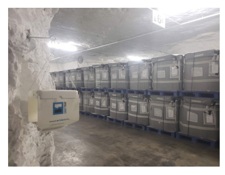
A <u>SightTrap</u> remote pheromone monitor is hung near to seed storage in a cave.

In parts of the Midwest, limestone was mined in the late 1800s and early 1900s and this excavation left behind an extensive network of caves. In the 1950's, investors started finding ways to utilize the abandoned underground space and decided to create leasable warehouse space. Today, some of these facilities are massive in scale. One particular cave system used for storage consists of 55,000,000 square feet of space with 6,000,000 square feet of leasable space and an additional 8,000,000 square feet leasable space available in the future. The consistent, cool temperature and humidity year-round in these caves provide good storage conditions for all kinds of items. Dried food goods, seed, Ready-to-Eat (MREs), tires, cave-aged cheese, USPS collection of rare stamps, Hollywood movie reels, mushroom farming, crude oil stockpiling, and vehicles are among some of the items stored in these underground caves.