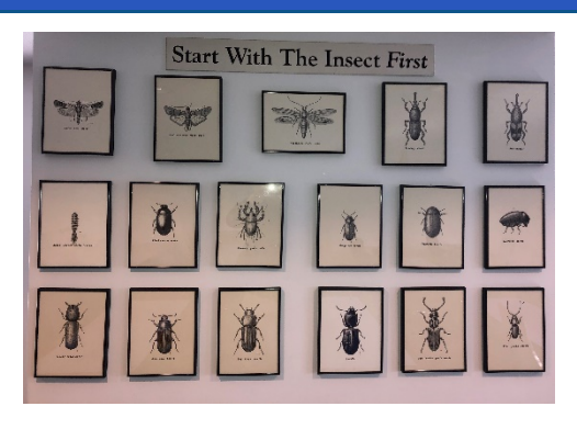
"Start with the Insect First" hanging from the wall in the Insects Limited classroom

Are you interested in the secret to the most effective way to get rid of your insect and rodent infestations? Learn their biology and how it affects their behavior. If you do that, you can then use that information against them to change their environment. These pests all have one thing in common. They all seek out micro-environment pockets where they survive and thrive. If we can change or eliminate these pockets, the pests will leave, or they will die.