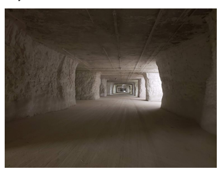
A vast labyrinth of carved out tunnels offers millions of square feet of storage space in caves in the Midwest.

Even in a cave 150 feet below the surface of the earth, pests can still find their way into underground storages through inbound materials trucked in one load at a time. In order to monitor this underground space for Indian meal moth activity, Insects Limited helped Fumigation Service and Supply install their remote pheromone monitoring system called SightTrap at one of these facilities used to store large quantities of crop seeds. When old Crop seeds that go unplanted by the farmer after the planting season are returned to and stored by the seed manufacturer. This returned seed notoriously has insect pest activity in it from the farmer's barn and a good IPM program will monitor this seed to allow for early detection and treatment.