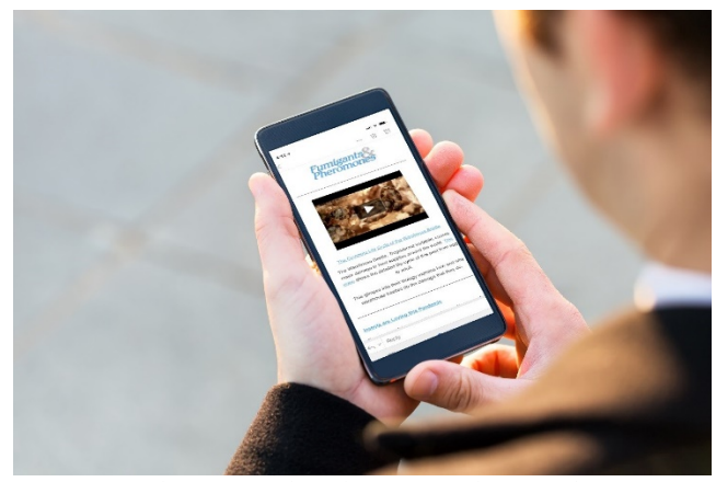
Fumigants & Pheromones digital copies can be viewed on computers, tablets, and smart phones

Currently the newsletter comes out monthly and is available on your computer or even on your smart phone. We at Fumigation Service & Supply and Insects Limited thank you for all your continued readership and comments over the past 38 years! Now we are looking forward to our 200<sup>th</sup> Edition!