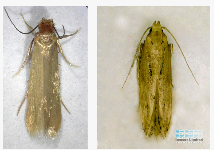
The webbing clothes moth on the left and the Angoumois grain moth on the right are both light-colored moths that are similar in size, yet their diets are very different. This example shows the value in a correct identification.

It is rare to find the source of your insects this quickly but it sure was a good reminder to always Start with the insect first.