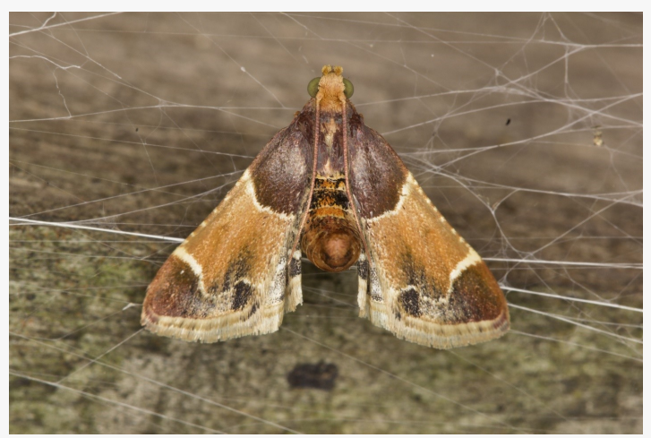
Top view of a Meal Moth (Pyralis farinalis), twice as long as an Indian Meal Moth

Meal moths feed on similar food material as the Indian meal moth and can be found on dried stored products like pet food, grains, seeds, and cereals but typically in areas that are lacking in sanitation.