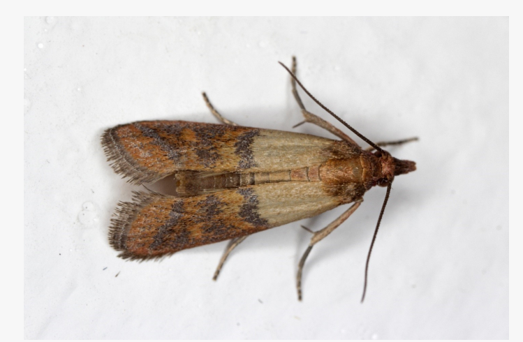
Top view of an Indian meal moth (Plodia interpunctella) - #1 Pest of stored grains

The Indian meal moth is the number one pest of grains and dried food goods and considered to be the top pantry pest in the world. This moth got its common name when it was found infesting the ground meal made from Indian corn a very long time ago.